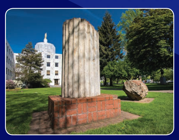
Column fragments from the Capitol destroyed by fire in 1935