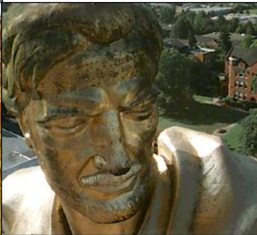
Pioneer prior to re-gilding