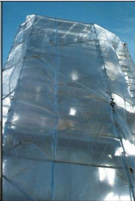
Plastic Cocoon Close-up