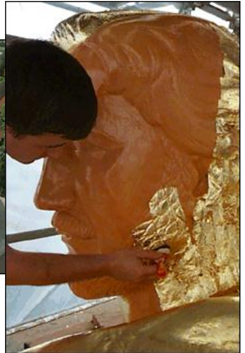
Soft Gilding Brush