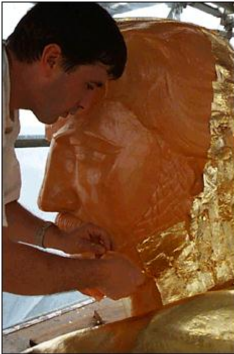
Gilder Applies Gold Leaf