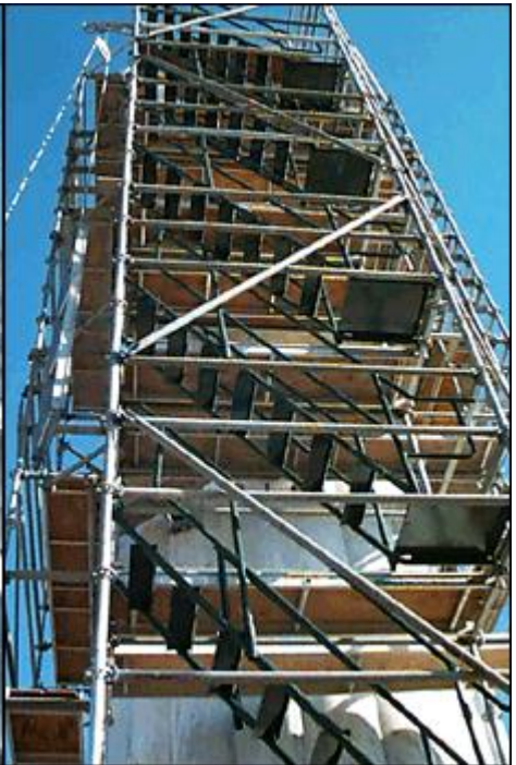
Scaffolding Has Staircase