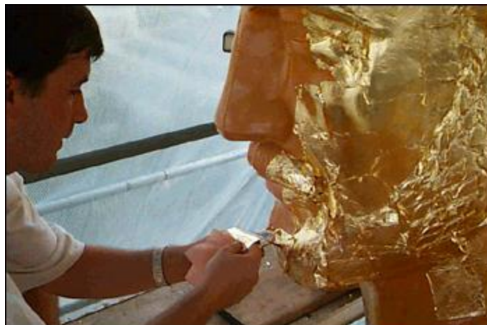
Gold Leaf in Booklets