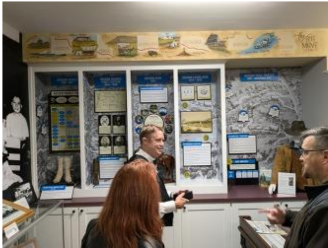
The KMH exhibition in full, which will remain at the museum. The Keizer family wedding socks in the lower left corner are a highlight!

greater historical context of "Wallace Prairie," which would become Keizer.